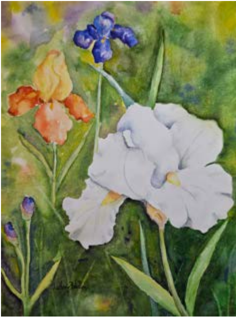
Summertime Colors - Watercolor 2023