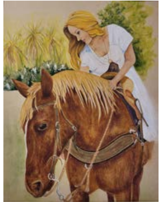
A Gentle Ride - Watercolor 2023