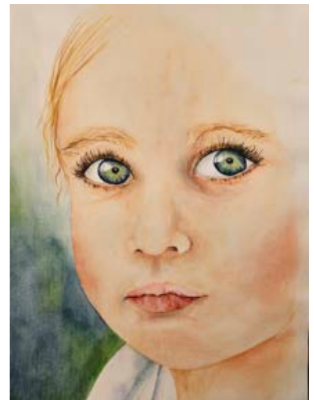
My Eyes Are On You - 2024 Watercolor