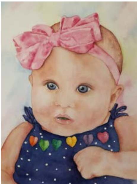
Great Granddaughter the 1st - Watercolor 2018