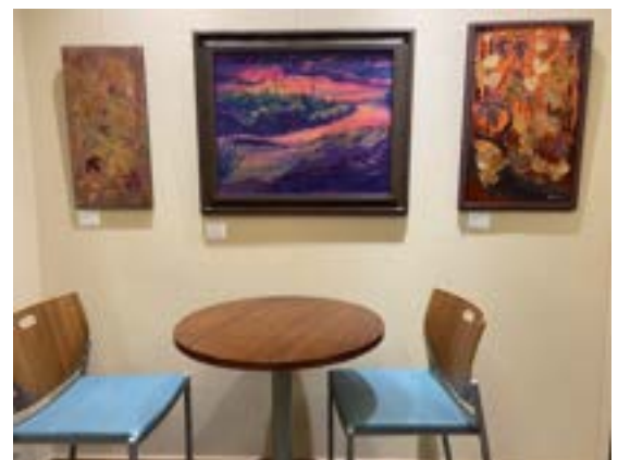
Roger's work at Eaton Library