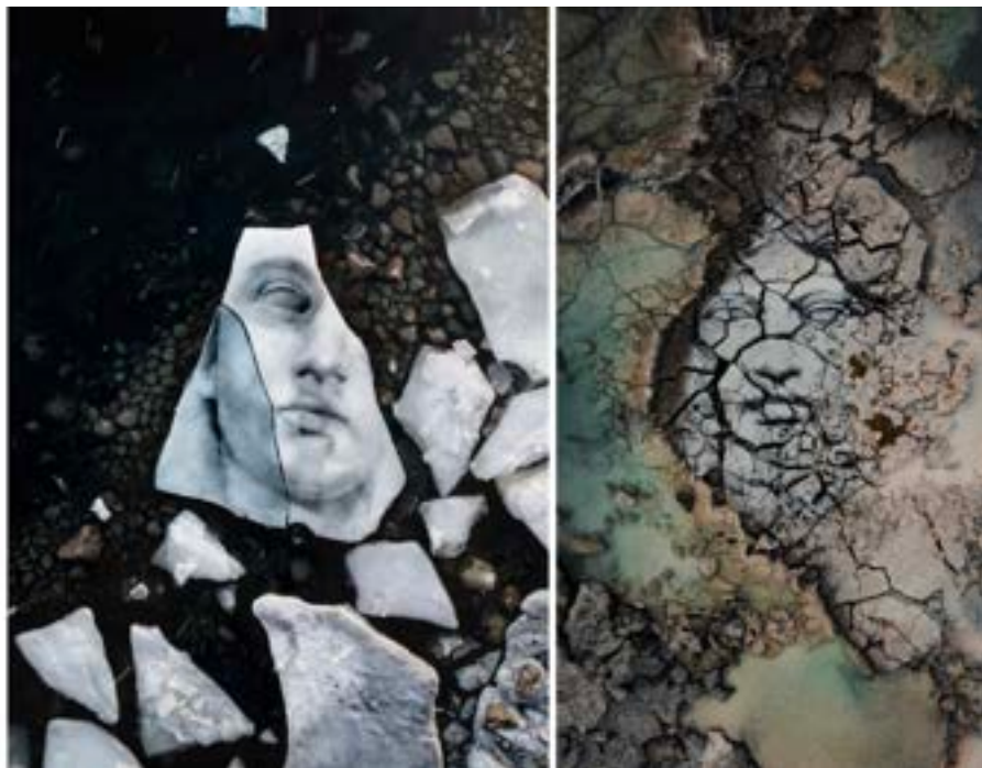
Left: "Remnants of the Past". Right "Prometheus".

According to thisiscolossal (2023) website, Popa's art sometimes broadly reflects themes of existence and time, and some of his [rock formation 'earth'] murals like "Prometheus" and "Remnants of the Past" (below) also emphasize shifts in aesthetic impulses. Mimicking Greek sculptures, the works appear "washed up on shore," drawing connections between antiquity and today and the differences in how we perceive beauty ( thisiscolossal , 2023)