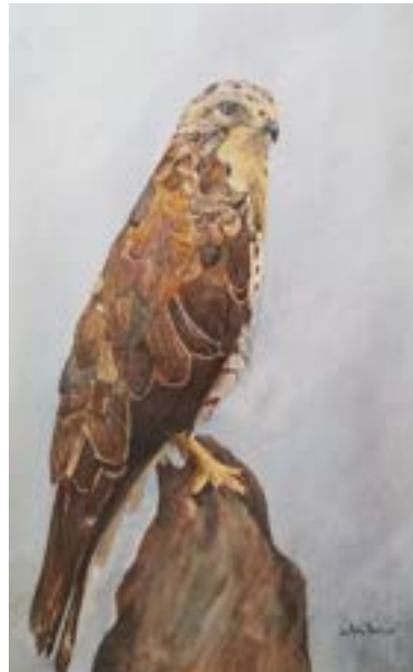
On the Hunt - Watercolor 2018