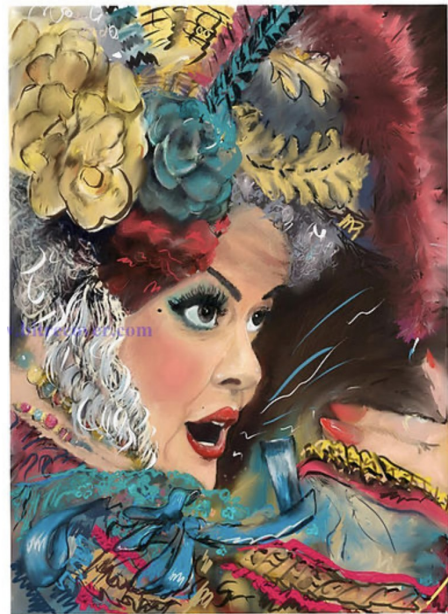
French Quarter Mardi Gras