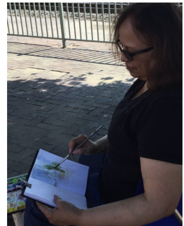
Plein Air Painting at the Depot Downtown

Plein Air Group takes a visit to the Old West Museum at Cheyenne Frontier Days