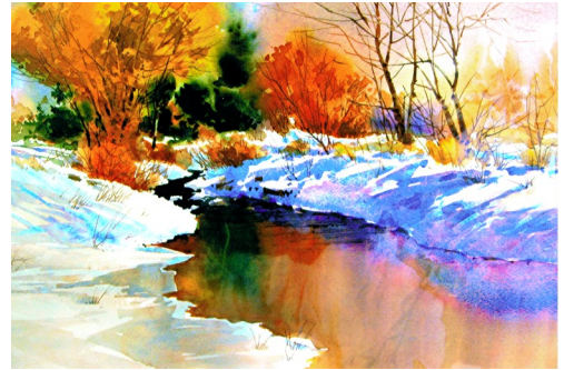
Painting by Carl Purcell

Payments can be made by sending a check to Showcase Art Center along with your completed application found on the Showcase Art Center Facebook page. For credit card payments call Showcase at 970-356-8593.