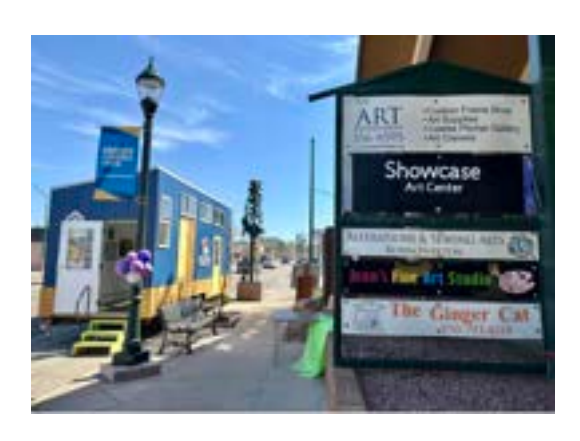
ArtHaus outside of Showcase Art Center

artists from Northern Colorado and Southern Wyoming displayed in the unique ArtHaus Mobile Gallery.