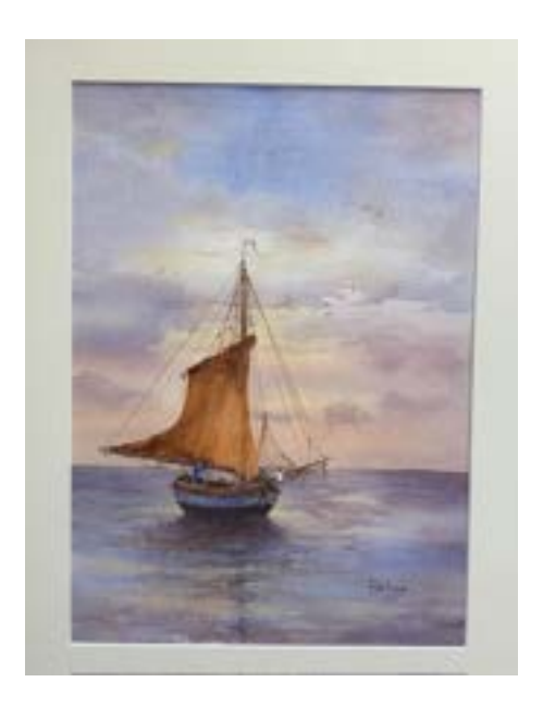
Dutch Vessel Original Watercolor, Rose Green 2019