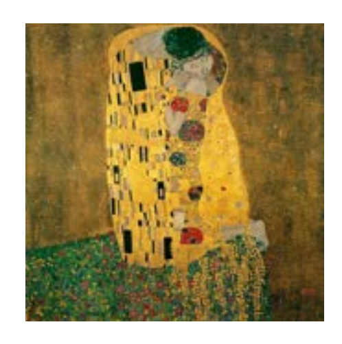
The Kiss (1907)

Later in his life Klimt focused on more personal and allegorical themes, which often featured erotic and more sensual content. Klimt is best known for his paintings of women characterized by rich colors, intricate patterns and flattened perspectives. A few of his most famous paintings include The Woman in Gold, The Kiss and Beethoven Frieze (mural). Klimt used a range of mediums: paints, colored chalk and graphic. The rich textures of some creations consisted of a wide variety of appliqué materials such as mirror, gem stones, gold foil, and mother of pearl (Tate.org.uk, 2023).