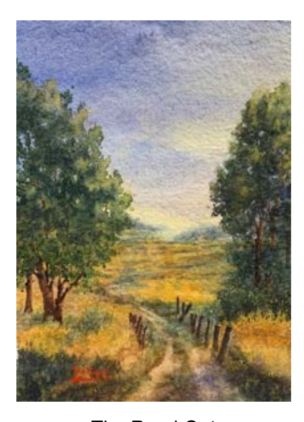
The Road Out Original Watercolor, Rose Green 2023

Friends describe Rose's artwork as soft and peaceful. Rose offered a few unexpected gifts of painting: "learning patience" and understanding the importance of "getting the values down first" - details follow later. Rose continuously reviews her in progress paintings looking for areas to "soften" finding those areas that are "too hard or too sharp". Viewing paintings upside down, looking at the painting through a mirror or a photographic or computer view helps... "I know a work is complete when I look at it".