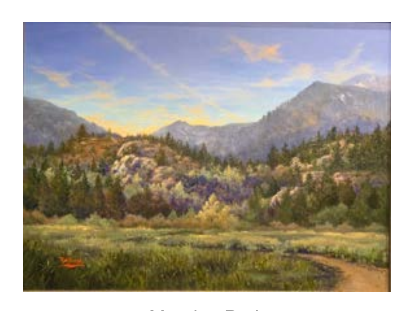
Moraine Park Original Oil, Rose Green 2022