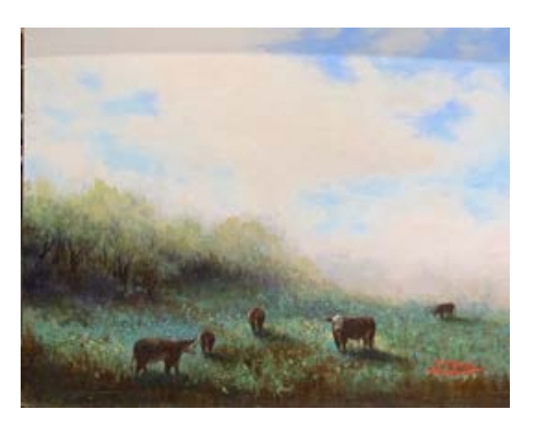
You Coming? Original Oil, Rose Green 2023