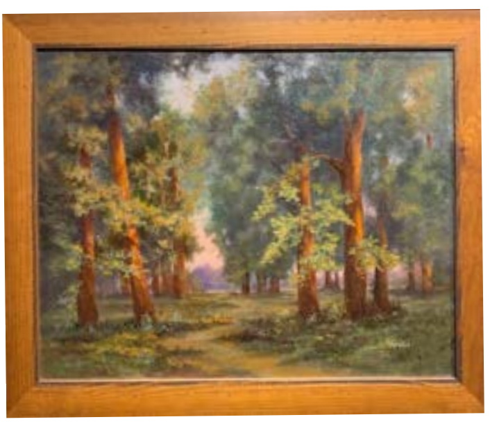
Cottonwoods Original Oil, Rose Green 2018