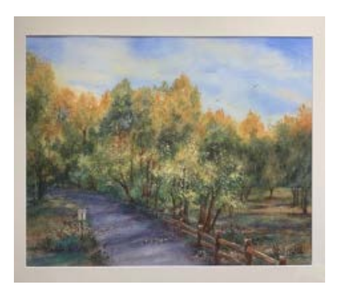
The Red Barn/Poudre River Original Watercolor, Rose Green 2021