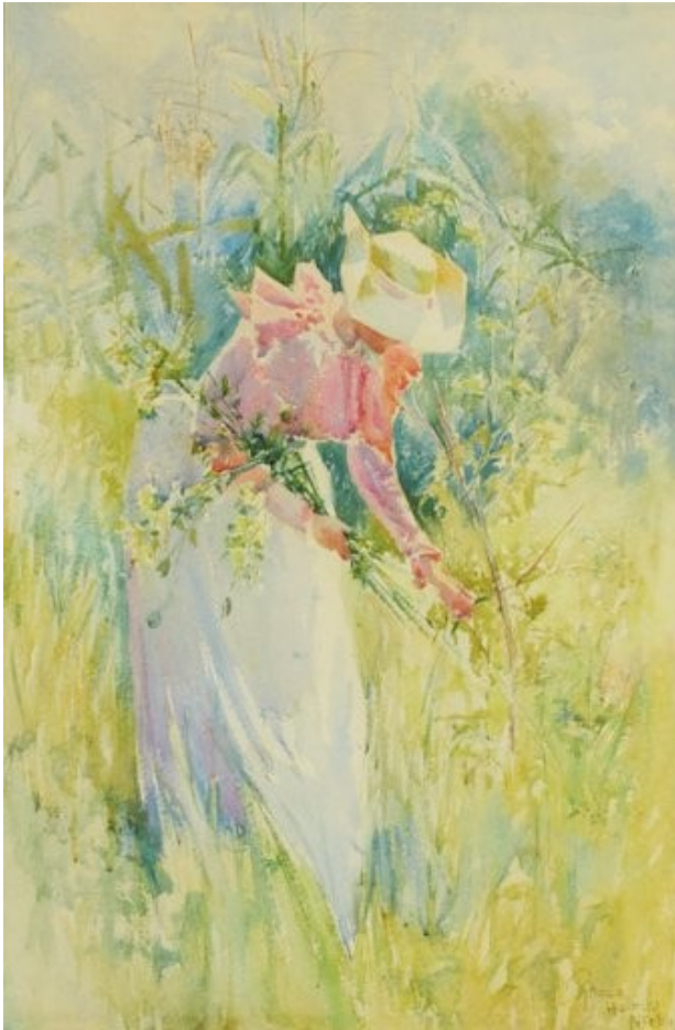
Picking Wildflowers by Rhoda Holmes Nicholls, c. 1900, watercolor on paper, High Museum of Art

RHONDA HOLMES NICHOLLS (British-American, 1854–1930)