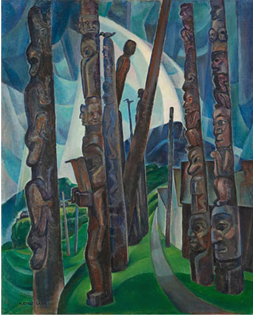
Kitwancool (1928; Glenbow Museum )

artistic isolation of Carr's previous 15 years, leading to one of her most prolific periods, and the creation of many of her most notable works. Through her extensive correspondence with Harris, Carr also became aware of and studied Northern European symbolism.