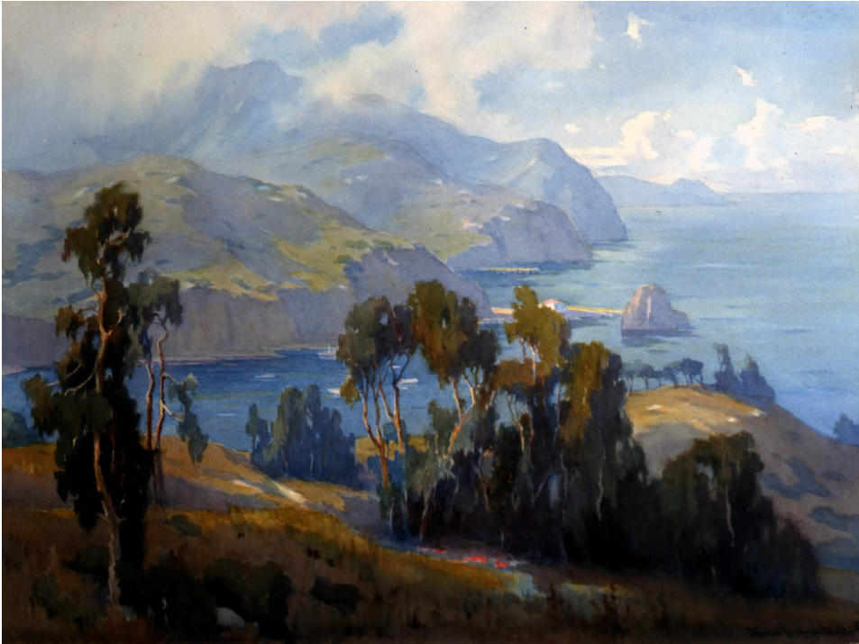
The Enchanted Isle" (Catalina) watercolor, c. 1922, The Fieldstone Collection grandfather, who had been a member of the Royal Academy in London, were artists.